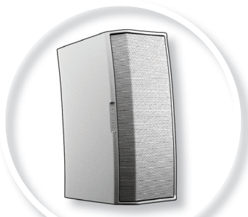
Channel 2 - Optional channel for interior monitor speakers.